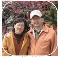
In front of the full blossoms of Japanese Apricots

To our dear partners for Japan mission in Christ,